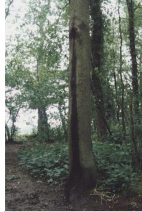
Old noctule & Daubenton roost