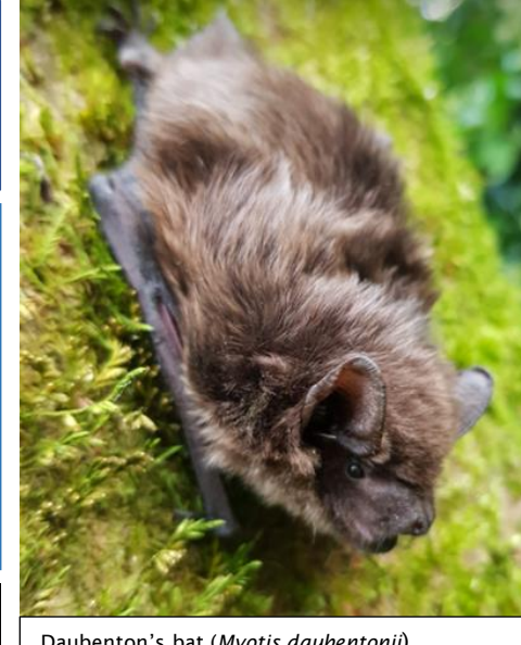
Daubenton's bat (Myotis daubentonii)