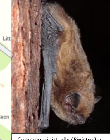
Common pipistrelle (Pipistrellus pipistrellus)

Old main roost near "bomb crater" subject to intense monitoring (fortnightly during season) between 1992 and 1998. Shared by noctules (60 bats) and Daubenton's (80 bats). Satellite roosts in blue. By 2008 roost had been abandoned.