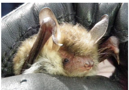
Natterer's bat (Myotis nattereri)