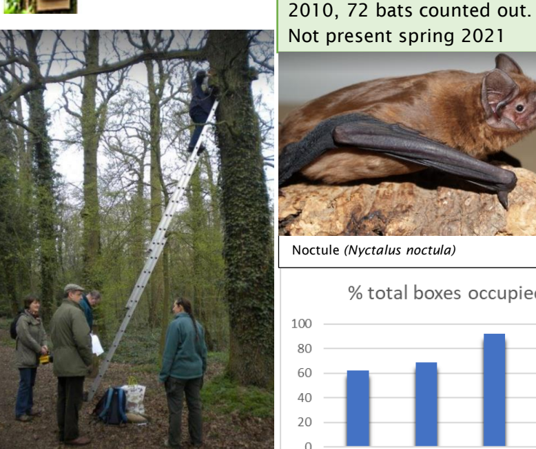
Bat group work party checking boxes